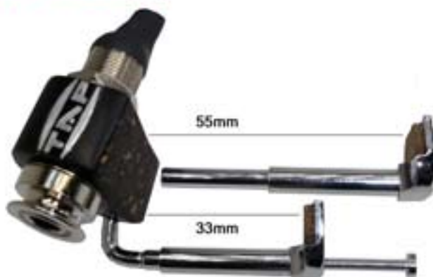
plate 10mm sensor 7mm

plate 2 sensors elastic 1 (2mm) elastic 2 (2mm optional)